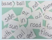
Compound word puzzle